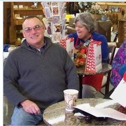
Hospice Angelic Care Volunteers listening to the Heart Health Presentation at Angelic's Attic and Hospice Thrift Store located in Tawas City